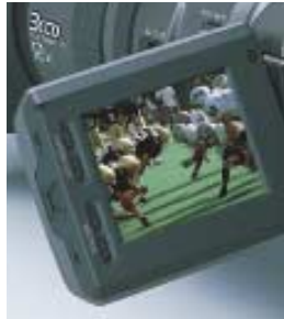
* Simulated picture

The DSR-PD150 has a high-resolution color LCD monitor for viewing the recording picture, or checking the playback picture on location. With its large screen, it is helpful in setting the menu or audio recording levels, as well as monitoring the camera and audio status while mounted on a tripod.