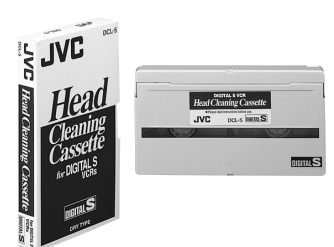
DCL-5 Cleaning tape