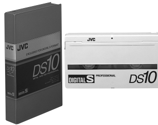
DS-10 10 minute tape