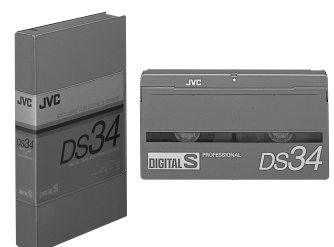
DS-34 34 minute tape