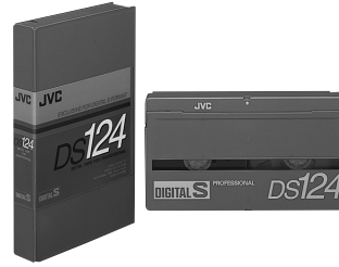
DS-124 124 minute tape