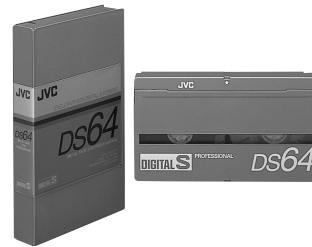
DS-64 64 minute tape