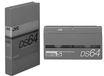
DS-104 104 minute tape