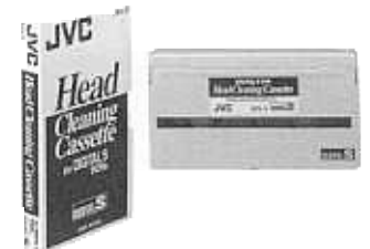
DCL-5 Cleaning tape