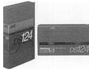
DS-124 124 minute tape