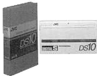
DS-10 10 minute tape