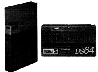
DS-104 104 minute tape