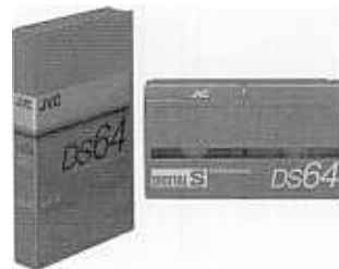
DS-64 64 minute tape