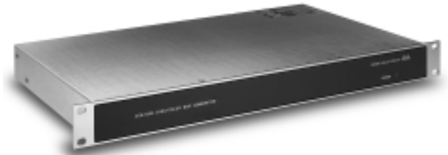
SCB-100N/SCB-200N Sync Color Bar Generators.

For your local Grass Valley Group sales and technical support representative see the list in the back of this catalog or inside the U.S. call: 1-800-547-8949.