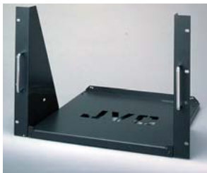
RK-C1700E ■ EIA Rack Mount Adapter